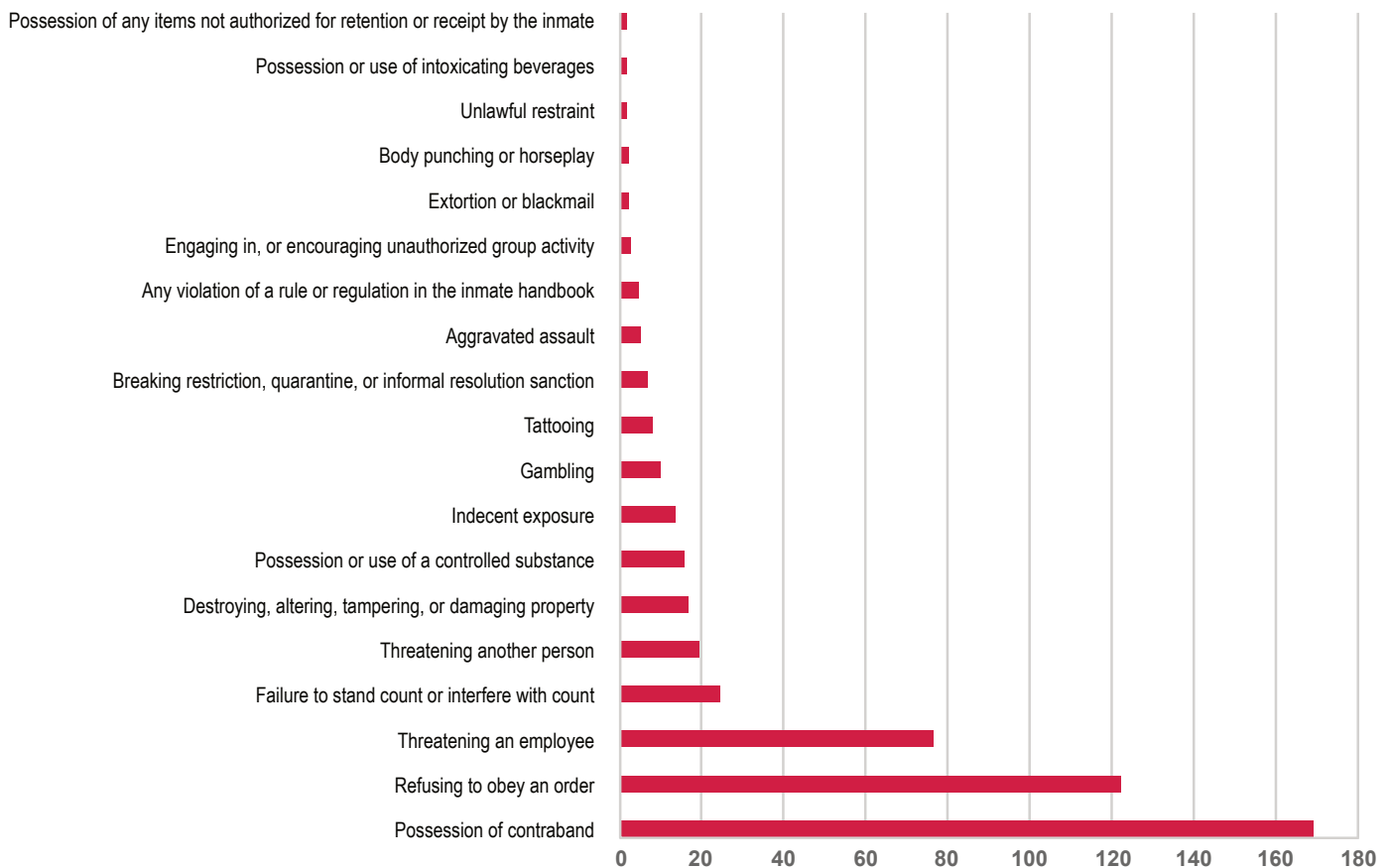
Figure 1. Total number of each misconduct across cases, as reported to the District Attorney's Office by the Department of Corrections

The modal number of misconducts reported was 7 (ranging from 0 to 107). On average, the last incident reported was approximately 8 years prior to resentencing (ranging from 1 to 31 years). Figure 1 shows the type and number of misconducts reported, aggregated across all cases 8 .